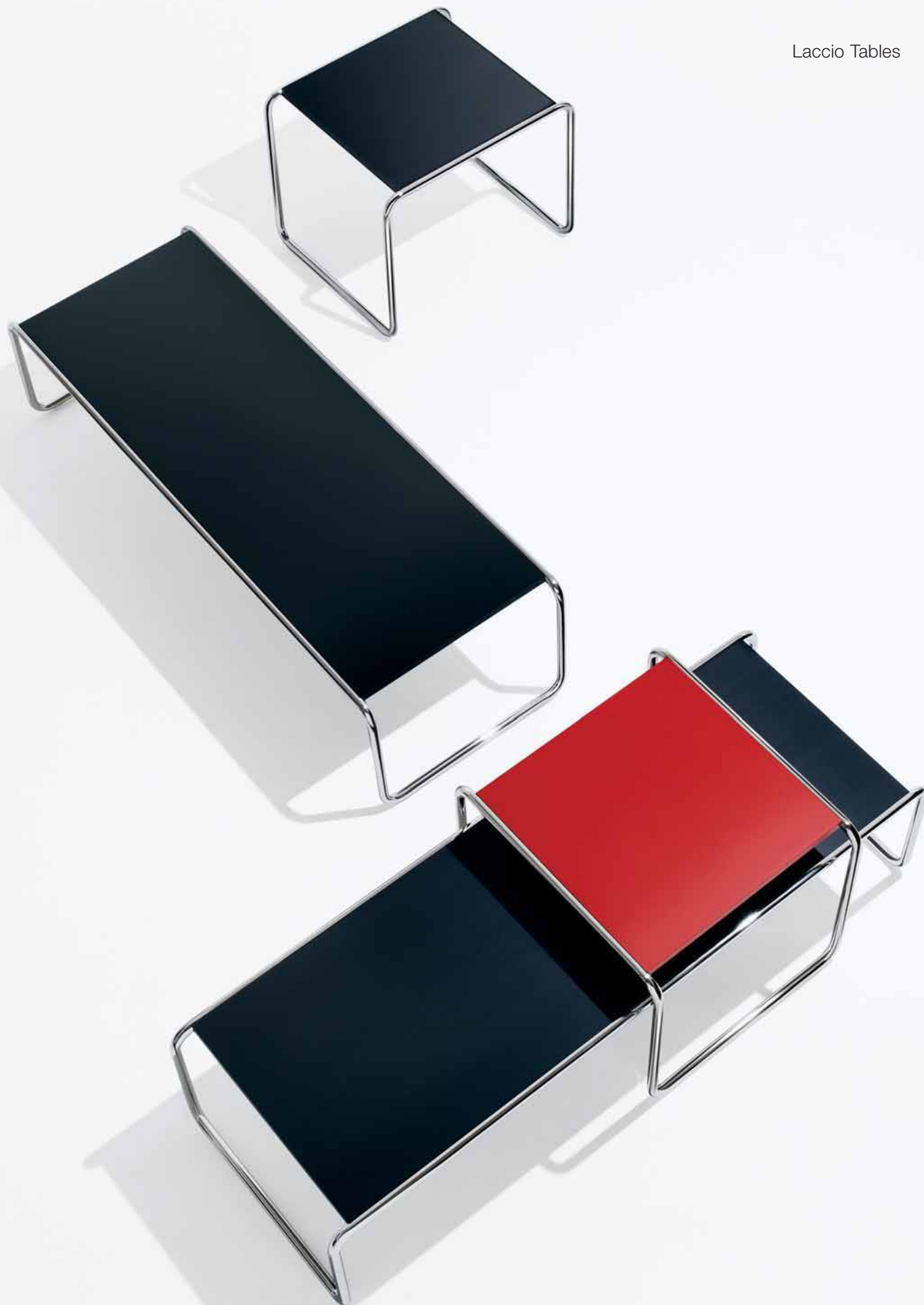
A study of lines in space, the Wassily Chair and Laccio Tables, shown left in the Bauhaus building in Dessau, Germany, stand as paradigms of Modernism. Laccio Tables, above, in Black and Red laminate; Tables also available in White laminate.