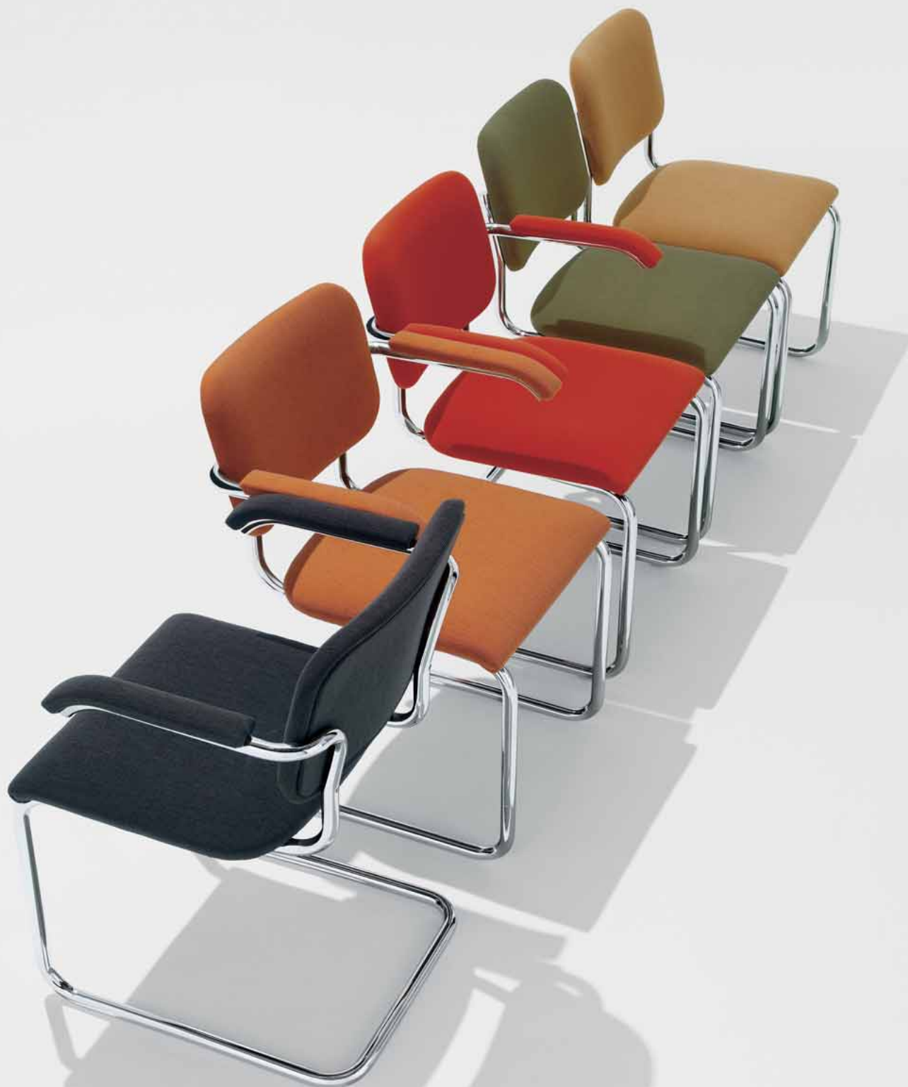
Cesca Chairs, above, fully upholstered with Spencer textile in Granite, Apricot, Saffron, Bay Leaf and Flax. Cesca Chairs, right, in Natural Clear Beech with handwoven cane inset seat and back. Cesca Chair with arms in Ebonized Beech with handwoven cane inset seat and back also shown.